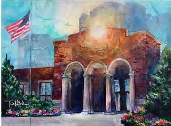
A New Dawn - Image Only