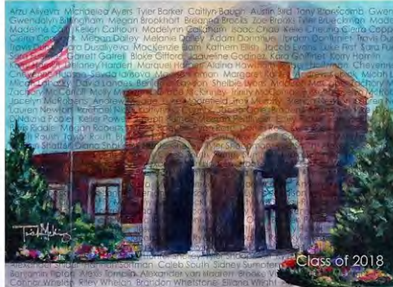
A New Dawn - with 2018 Graduates' Names